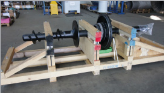
MFS III (HALBERG)