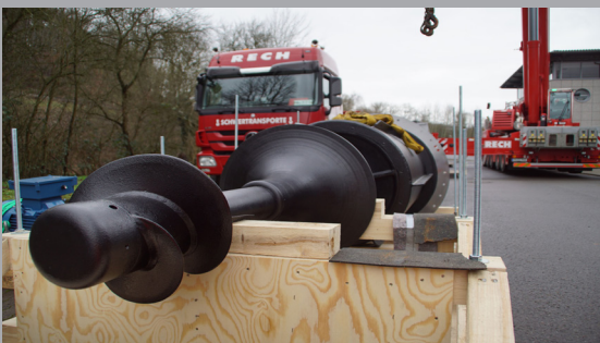
MFS IV (HALBERG)