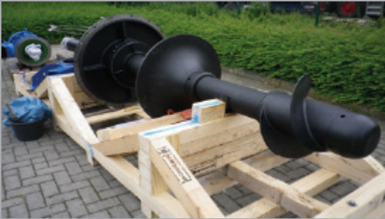
MFS VI (HALBERG)