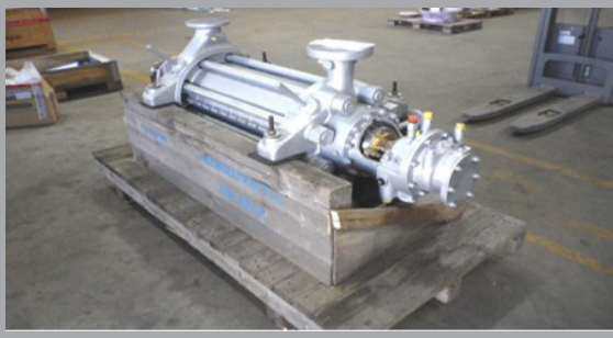
TSH 65/12 (BALCKE-DÜRR)