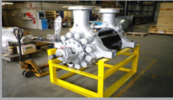
HD 150x8 (HALBERG)