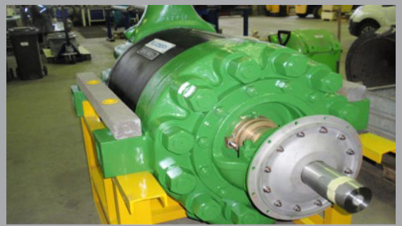
TSH 150x6 (BALCKE-DÜRR)