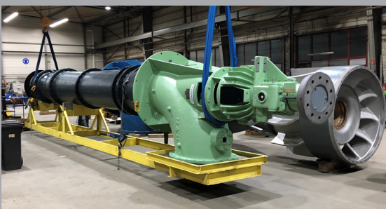
KA8 (175) II (MAN)