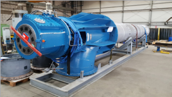
RKCA 12001 / 12002 (HALBERG)