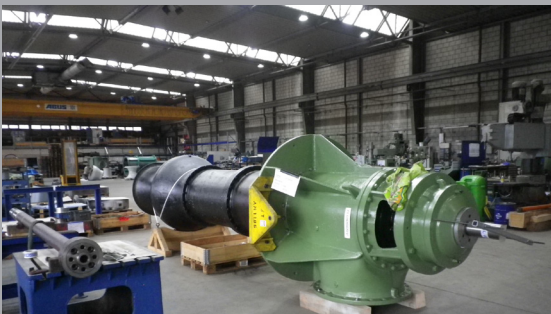
SEZ 800 (KSB)